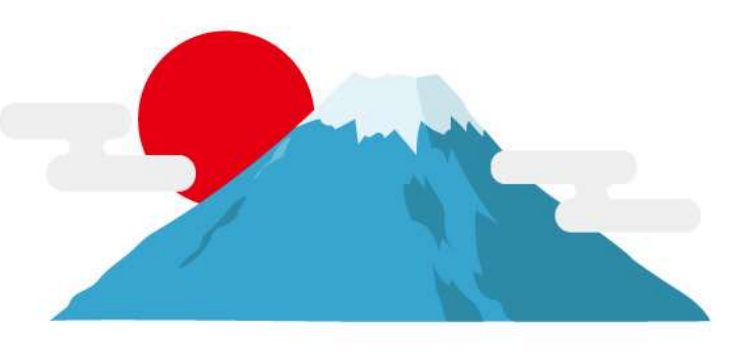
Figure 1. Type figure name here