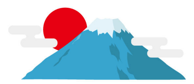
Figure 1. Type figure name here